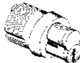
Interchangeable Core Cylinders allow the lock to be rekeyed without having to disassemble the lock.